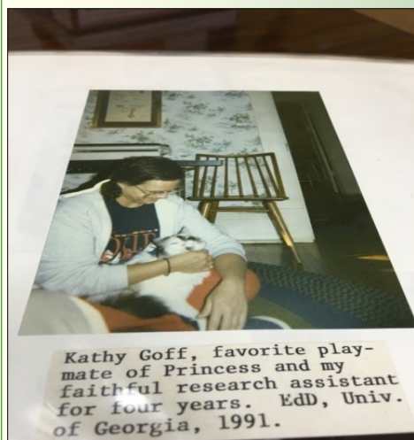
Words on Marble: Something to treasure

Upon arriving in Athens, Georgia, I found that Dr. Torrance had retired and was working out of his home. I met him within 2 weeks of arriving. He called me the next day to hire me to evaluate his assessment, Sounds and Images . I continued to work for Dr. Torrance daily as his personal research assistant for the next four years. Upon completion of my doctorate in 1991, we continued to work together and correspond weekly until his passing in 2003.